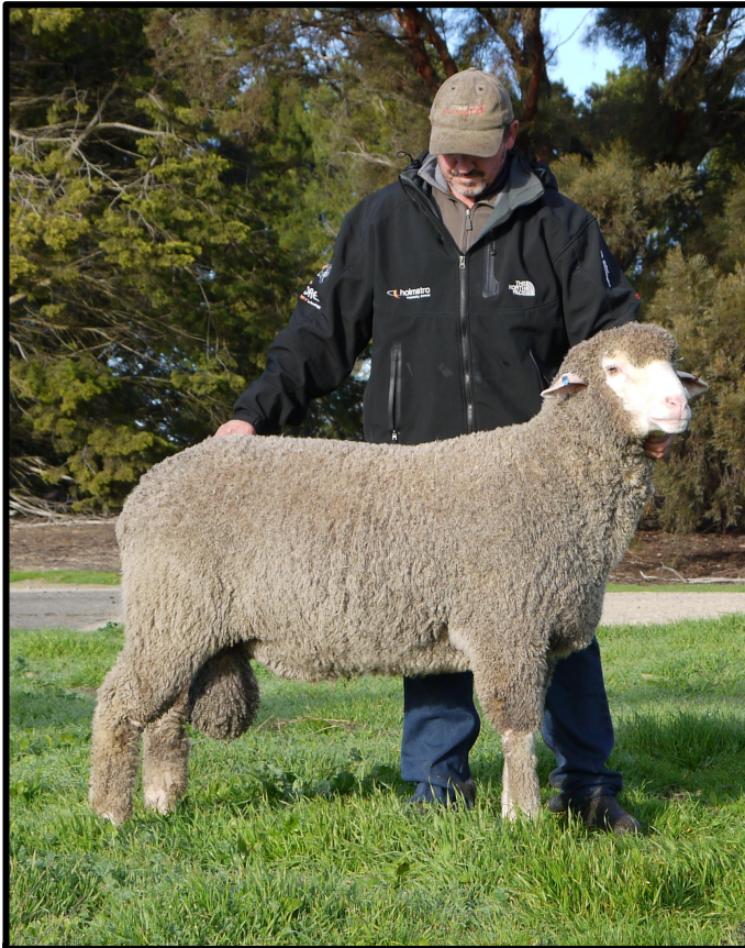
RA R022 June Drop ET bred Sire RA080

18.6 micron, 2.5 S.D, 13.6 CV & 100 % Comfort Factor Carries Double Copy of the Poll Gene 'PP'